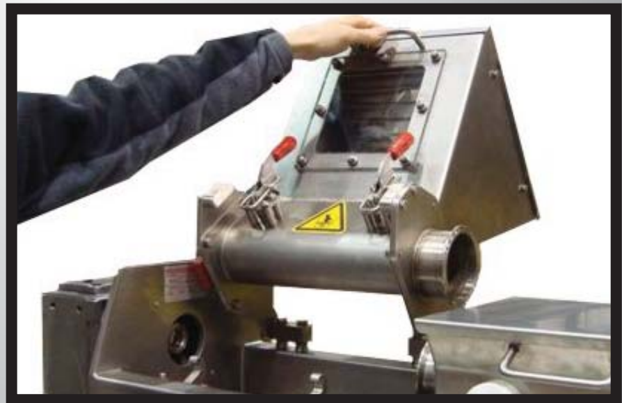
Rotating the Intake Hopper